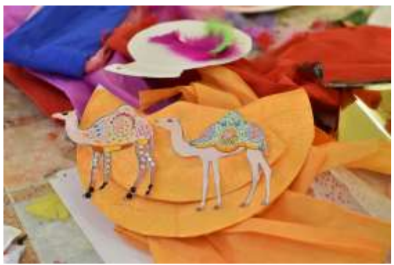
Fitzrovia Centre - Camels in the community 2017

Over £79,000 is being awarded to the following projects for spring 2018: