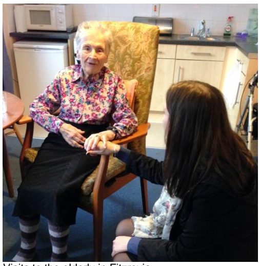
Visits to the elderly in Fitzrovia

Derwent London staff raised £1,200 and delivered gifts to the elderly in Fitzrovia yesterday. Coupled with generous food donations from Derwent London catering partner, The Good Eating Company, the cash raised allowed staff to create some amazing food hampers and purchase much appreciated gifts.